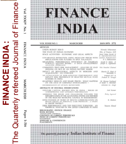
FINANCE INDIA: The Quarterly refereed Journal of Finance